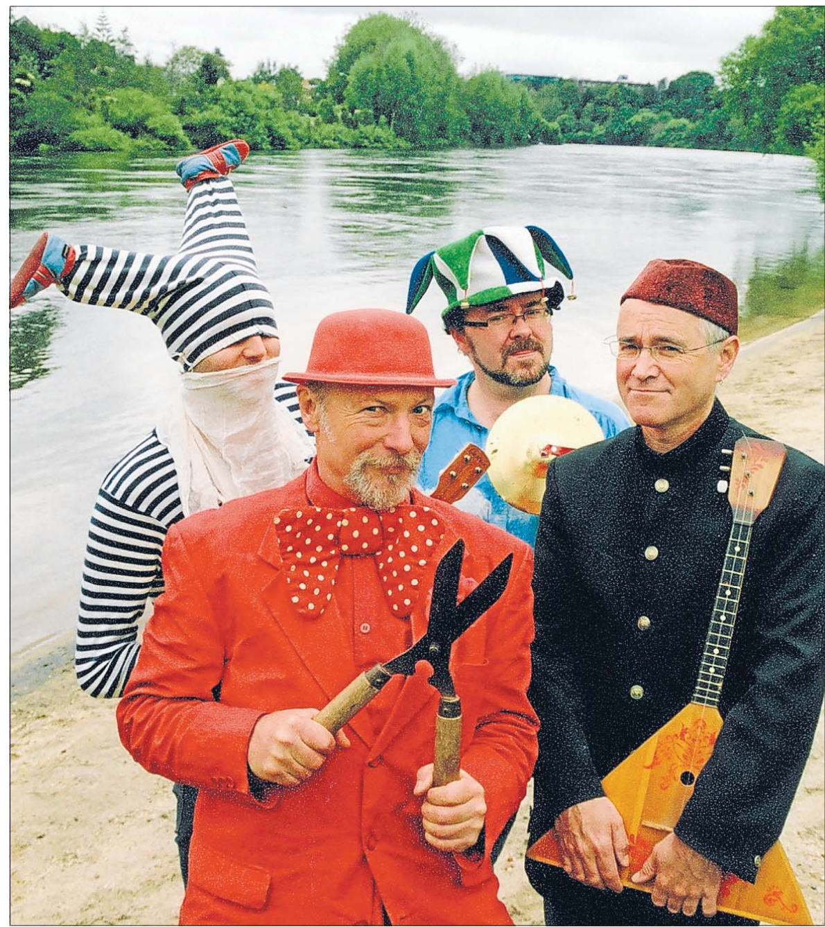
Big Muffin Serious Band: Long-serving New Zealand ukulele band; the musical instrument at right is a mazheet, commonly known as a Balkan kulele.

In keeping with Dunedin's rich history as a music hub, the festival presents a bi-annual music event, Lines of Flight, that will be held in Port Chalmers for three days.